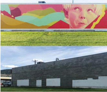
Uptown Rutland Business Association